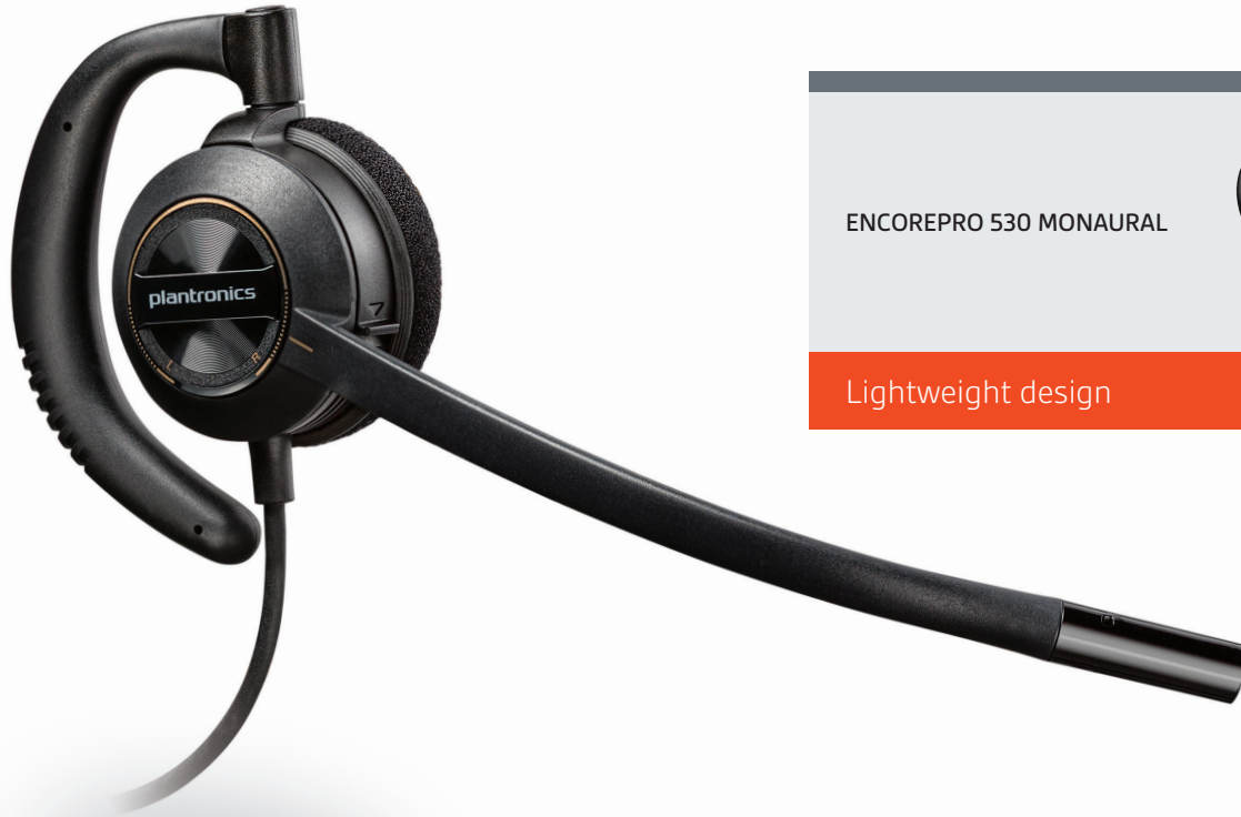
ENCOREPRO 530 MONAURAL

With wideband audio designed in from the start and a custom noise-canceling microphone on a flexible boom with positioning guide marks, you and your customers are set for a best-in-class experience.